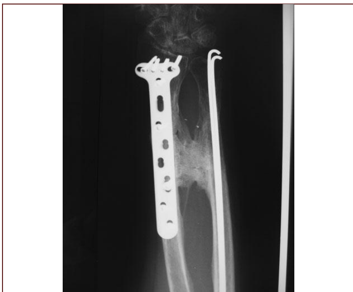
Figure-3: Radioulnar synostosis after 9 months of plate osteosynthesis

after the former surgery, leading to almost complete recovery of the forearm rotation. Radiographs showed recovery of normal radial anatomy— radial inclination 20°, volar tilt 10°, radial length 10 mm, neutral ulnar variance, no articular step-off—in 10 of 12 A3 fractures.