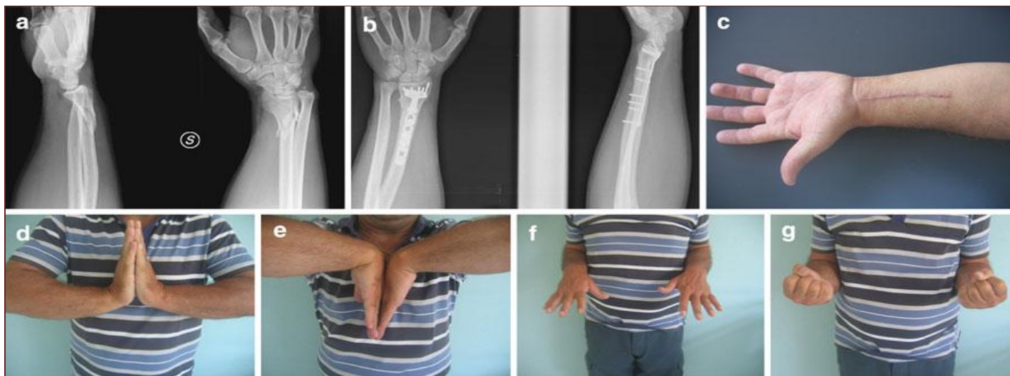
Figure-4: Excellent radiological (a,b) clinical (c,d,e,f,g) results after 6 months after plating a C2 fractures in 45 years old male

with plates or other nonbridging methods; when distraction fails to obtain adequate reduction, the use of bone grafts, K-wires and supplementary screws are included in the procedure. The hardware is removed after radiographic evidence of consolidation (mean time: 124 days) and wrist motion has been initiated. Excellent clinical and radiographical results are reported with this technique. [7] Disadvantages of this method include the long period of immobilization of the wrist, the need for a second operation to remove the hardware, potential attritional damage to the extensor tendons, difficulty in reducing and stabilizing the volar fragments of the distal radius, and the risks related to overdistracted of the radiocarpal joint (CPRS, finger functional impairment). [3,4] Fixed-angle volar plates can adequately stabilize articular fragments and both volar and dorsal comminution, even in osteoporotic bone. [8,9]