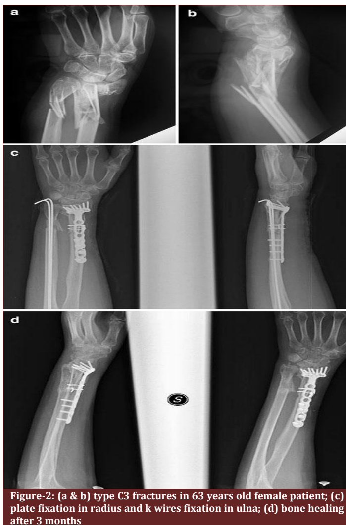
Figure-2: (a & b) type C3 fractures in 63 years old female patient; (c) plate fixation in radius and k wires fixation in ulna; (d) bone healing after 3 months